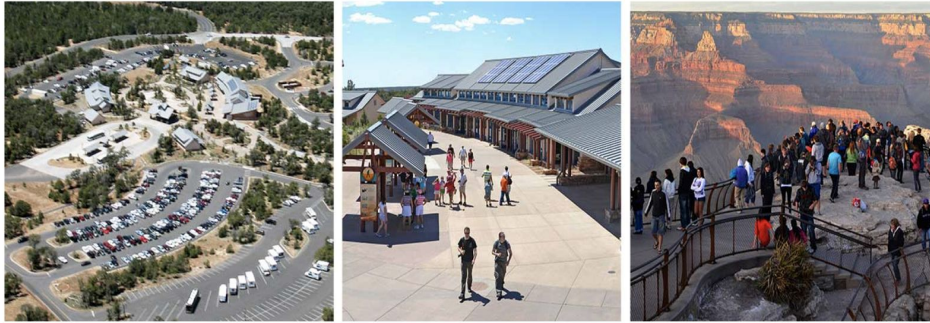
Left to right: 1) Visitor center plaza & parking 2) Visitor center's outdoor exhibits, 3) Watching sunset at nearby Mather Point.

Open Left to right: visitor center parking and plaza overview, visitor center and outdoor exhibits, people watching sunset at Mather Point