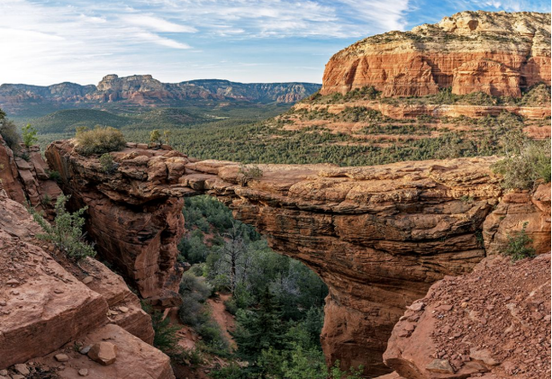
Devils Bridge (15 minutes to hike/walk to)