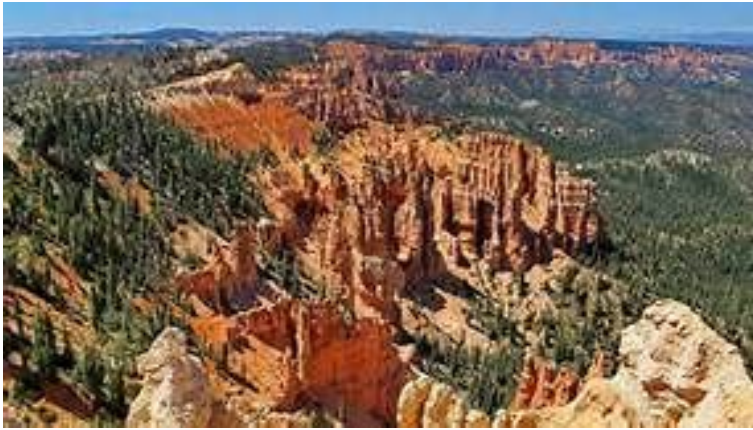
Rainbow Point (highest point 9,000 feet elevation)