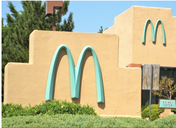
Only McDonalds with Blue Arches in the World

Visitor Center: 331 Forest Rd, Sedona, AZ 86336