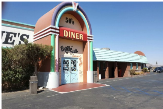
Peggy Sue's 50's Diner 35654 Yermo Road Yermo, CA 92398