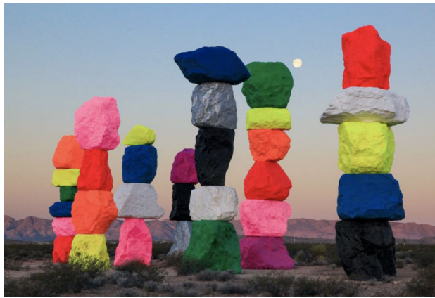
Seven Magic Mountains