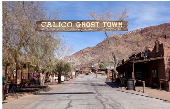
36600 Ghost Town Rd, Yermo, CA 92398-0406