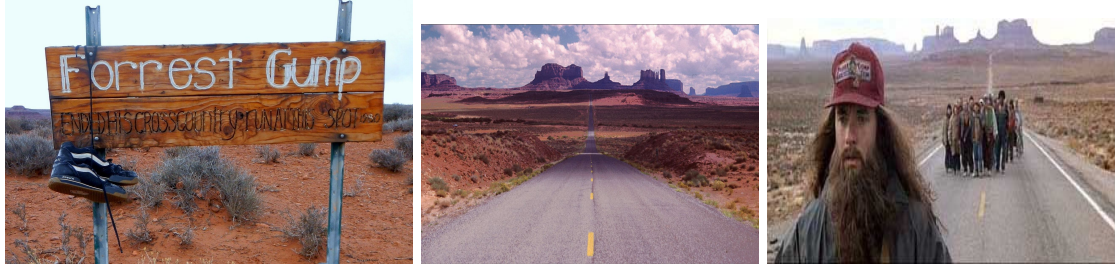
Forrest Gump Sign in Monument Valley (Located on UT-163 at mile marker 13.)