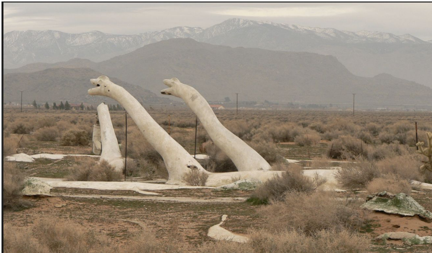
Abandoned Dinosaur Park 16050 Ocotilla Rd, Apple Valley, CA 92307, USA

-----Peggy Sues to Dinosaur Park = 45 minutes-----