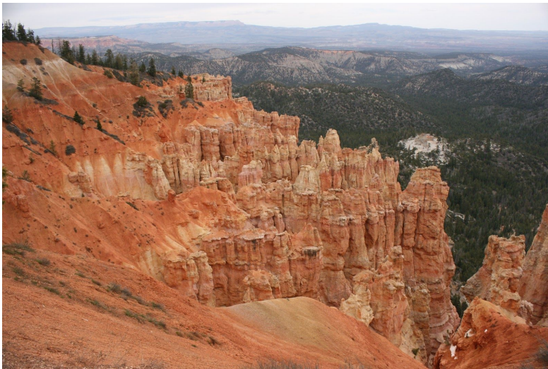
Black Birch Canyon