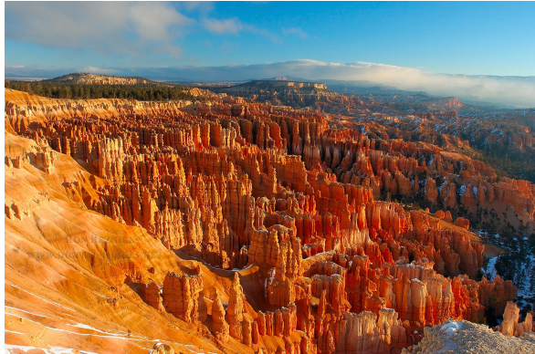
BRYCE CANYON AMBITHEATRE IN WINTER - Inspiration Point at Sunrise - Bryce Canyon National Park - Utah

Visitor Center: Hwy 63/1 Park Rd Bryce Canyon, UT 84764 8am-8pm